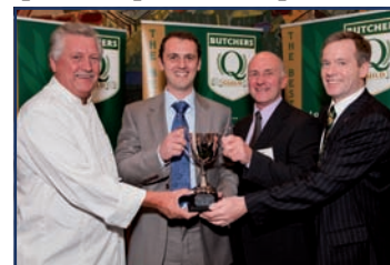
Brian Turner Hands Over The Supreme Diamond Award For Turnbull's Garlic & Chilli Bacon